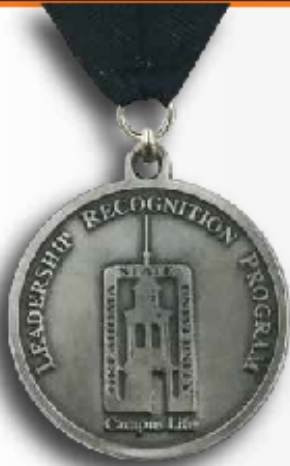
LEAD GRADUATION MEDAL

➔ TRACK 1: Leadership Certificate Leadership Certificate recipients will be recognized at the annual President's Leadership Recognition Ceremony in April. • Attend three FALL seminars and three SPRING seminars.*